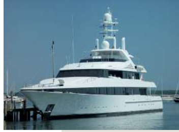
mega yachts and cruise ships